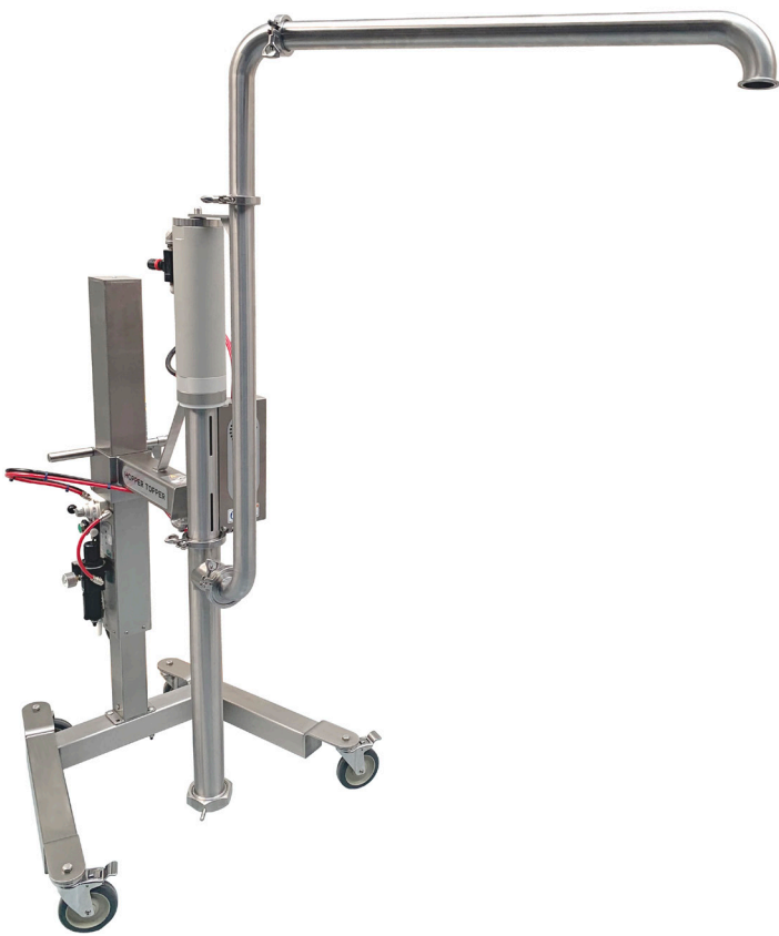
Example picture; machine equipped with accessories

The Hopper Topper Powertopper transfer pump will help to keep your production flowing smooth. With our gentle pumping technology, your products will be quickly transferred without sacrificing quality.