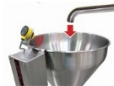
Photo Sensor monitors product level in the hopper and controls the pump