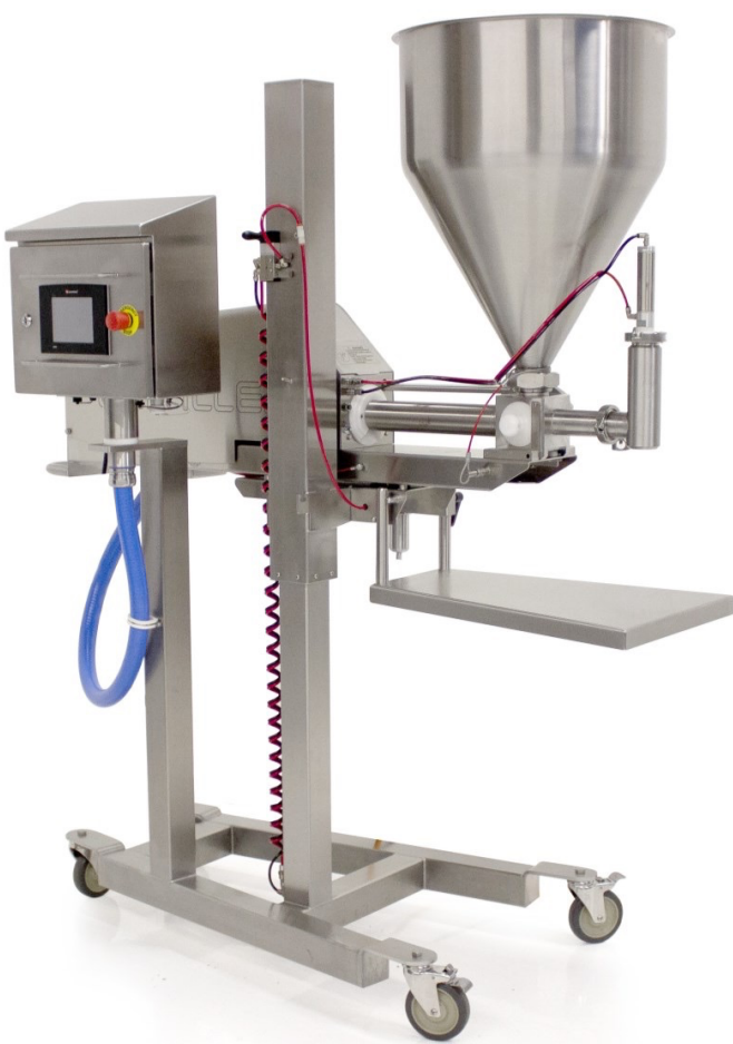
Example picture; machine equipped with accessories