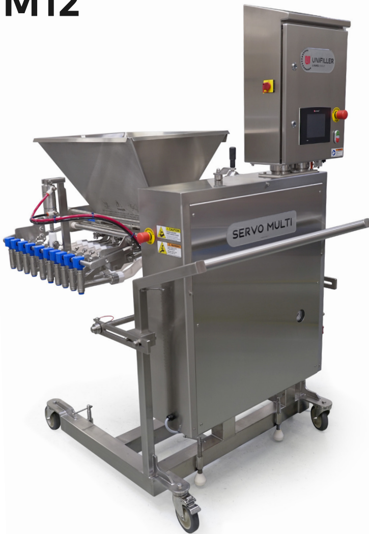
Example picture; machine equipped with accessories

The Servo Multi Depositor is the ideal Multi Piston Depositor for industrial environments. Built on the extensive experience with pneumatic multi piston depositors, the servo function provides for the most accurate and fastest depositing, electronic recipe storage and flexibility beyond any traditional piston depositor.