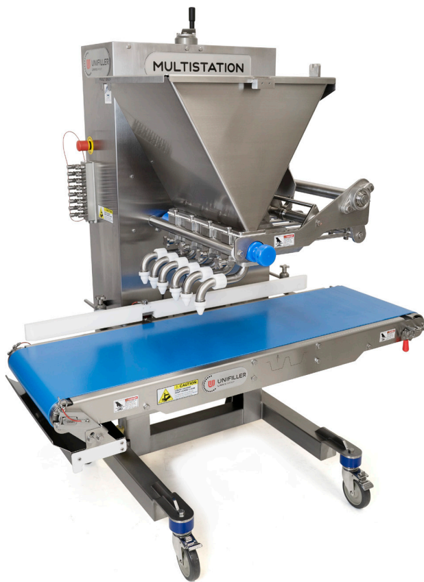
Example picture; Multi Station M600 equipped with accessories

Traditional confectionary gearwheel depositors are used worldwide, and are known for performing very well but with limitations in production speed and type of products. In these applications the UNIFILLER Multi Stations M600 and M800 are the perfect solution to traditional gearwheel confectionary depositors.