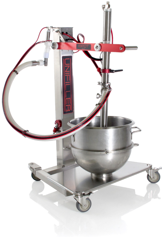
Example picture; machine equipped with accessories

With its user-friendly, easy to use design, this versatile machine allows you to draw and deposit smooth products directly from a bowl or pail. The iSpot Depositor can be fitted with several Unifiller attachments to create perfectly looking single-serve desserts or even be used for spraying syrup or as a mini transfer pump to fill your hoppers.