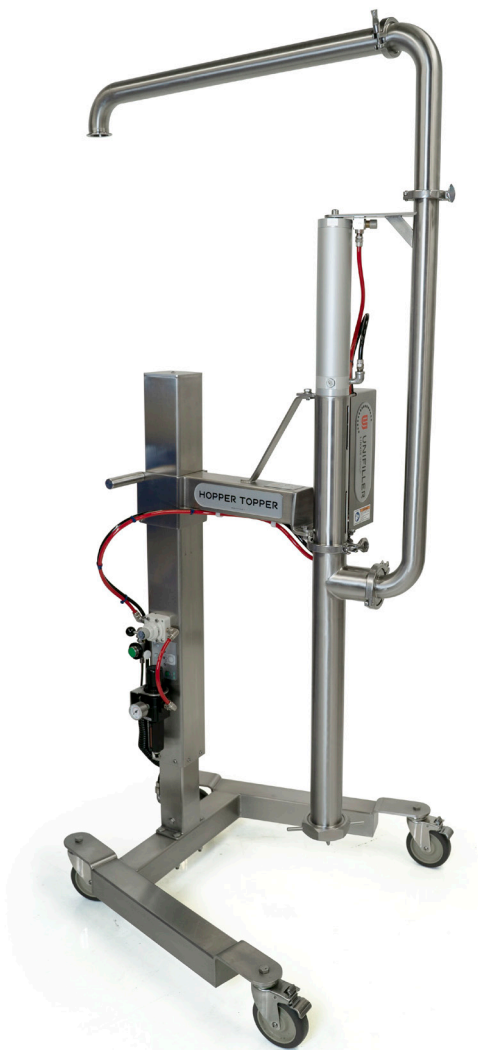
Example picture; machine equipped with accessories

The Hopper Topper Powerlift transfer pump will help keep your production flowing smooth. With our gentle pumping technology, your product will be quickly transferred without sacrificing quality. No matter if you process smooth cremes or doughs, chunky fruit- or nut fillings, soups, salads or sauces, the Unifiller transfer pump perfectly transports all kinds of products without affecting its properties.