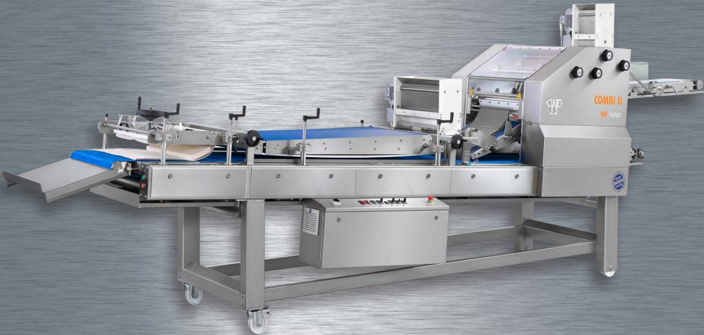
COMBI U Long Moulder

WP HATON BV Industrieterrein 13 // 5981 NK Panningen // Netherlands // Phone +31 77307-1860 // Fax +31 77307-5148 // info@wp-haton.com // www.wp-haton.com